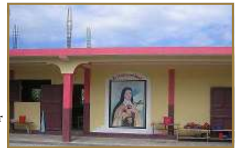
Ecole Ste. Therese