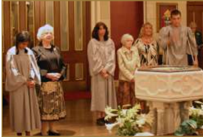
Easter Vigil—The Elect and Godparents

They come from various stages in life – single, preparing for marriage, married with young children, and a recent retiree. They call Louisville home but may have come from different parts of the state or region. They include an attorney and an engineer, a college music major, an intern at University of Louisville Hospital, and a recent graduate with a marketing and finance degree studying for the CPA exam.